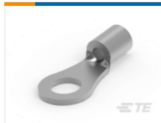
TE Part # 133521-1 TERMINAL SOLISTRAND 22-18, GOLD PLATED